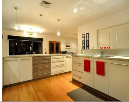
7 Charolais Mews EATON, WA