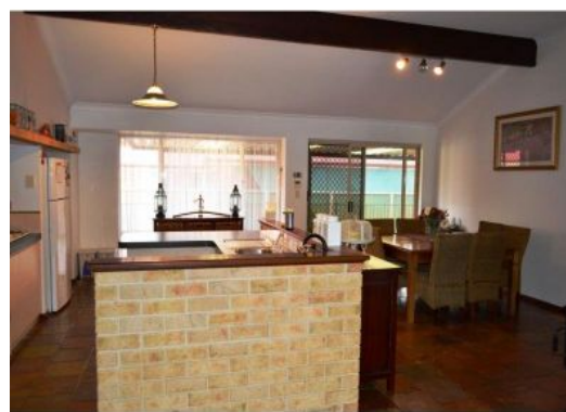
14 Boyanup-Picton Road DARDANUP, WA