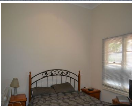
1/82 Clarke Street SOUTH BUNBURY, WA