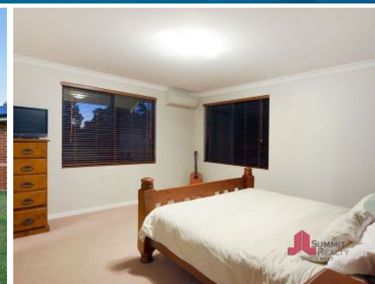
18 Grand Entrance AUSTRALIND, WA