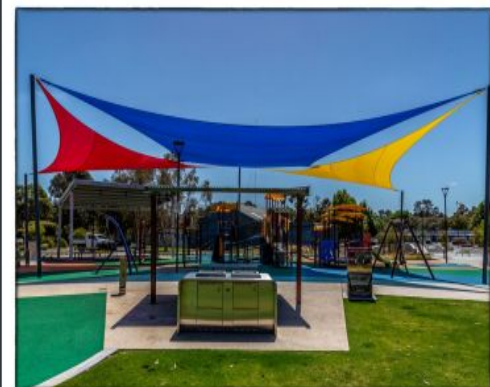
Lot 20 The Grove Capel, WA