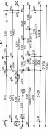
FLOOR PLAN SCALE 1:100

ALL TRADER NOTE: KEEP AREA 50MM EITHER SIDE OF CENTRE KEEP AREA 50MM CLEAR OF ALL CHANGING BEARING POINTS NOTE: ALL CONSTRUCTION TO BE IN ACCORDANCE WITH ALL ENGINEERS DETAILS. ALL CONSTRUCTION TO BE IN ACCORDANCE WITH ALL STANDARDS AND THE BUILDING CODE OF AUSTRALIA NOTE: DO NOT SCALE FROM THIS DRAWING. CHECK ALL DIMENSIONS ON SITE PRIOR TO SETTING OUT AND COMMENCING ANY WORKS.