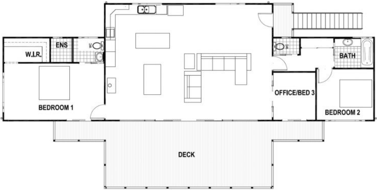
FLOORPLAN - UPPER LEVEL