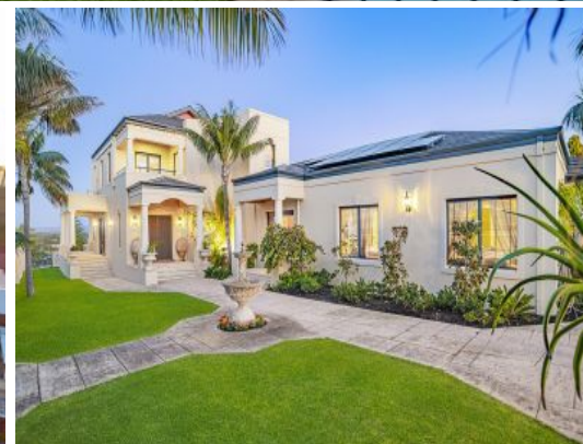
17 Roberts Crescent Bunbury, WA