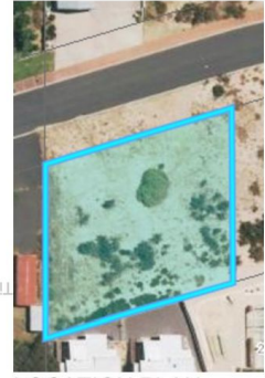
LOCATION PLAN NOT TO SCALE