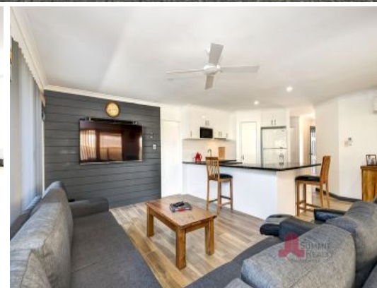
Unit 1/18 Kylie Terrace Binningup, WA