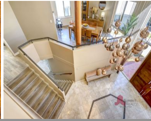
13 Roberts Crescent Bunbury, WA